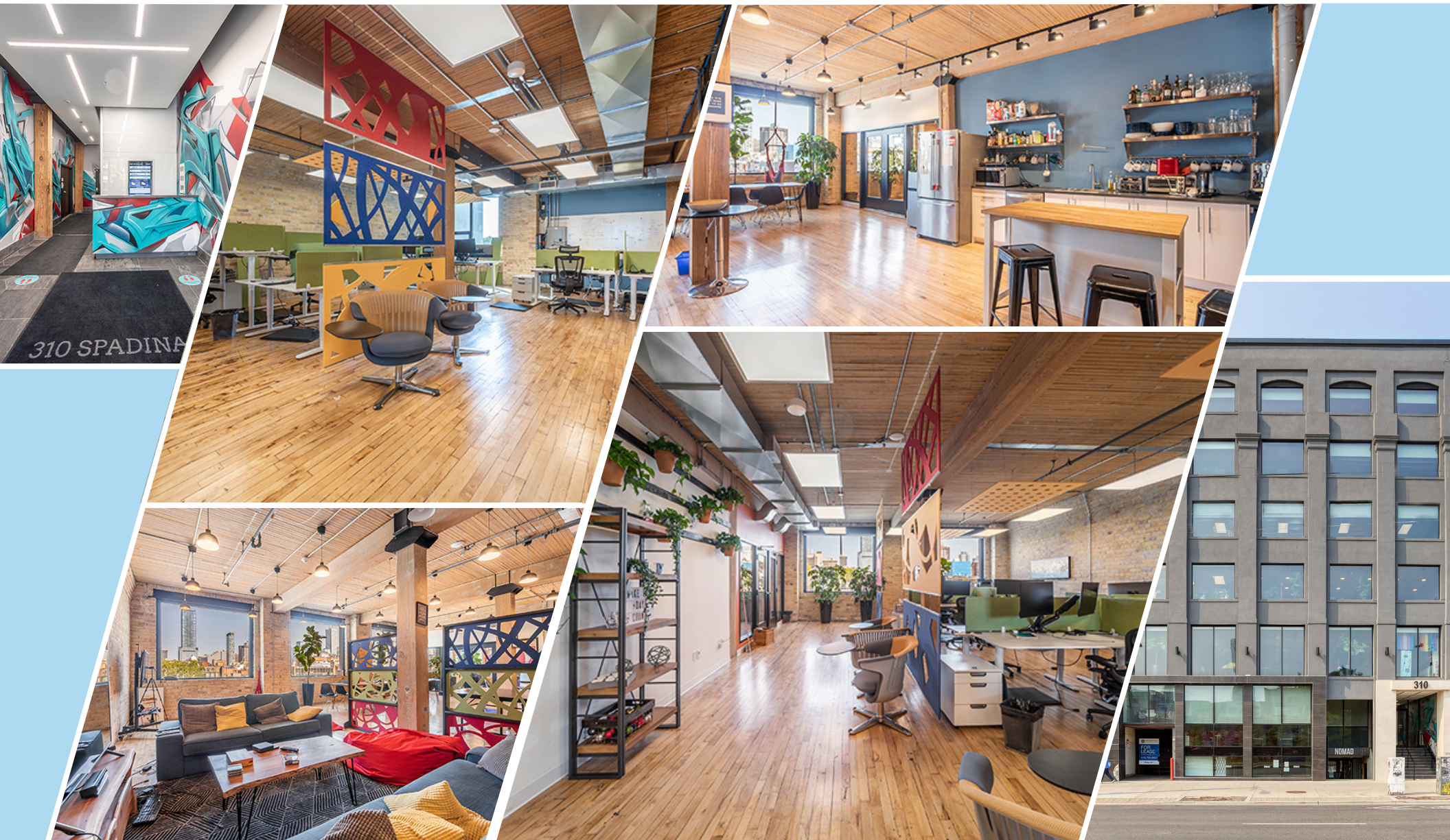
CLOCKWISE FROM TOP LEFT: Building Lobby, Open Area with Workstations, Kitchen/Lounge, Building, Open Area, Collaboration Space